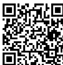
QR codes for Android and for iOS